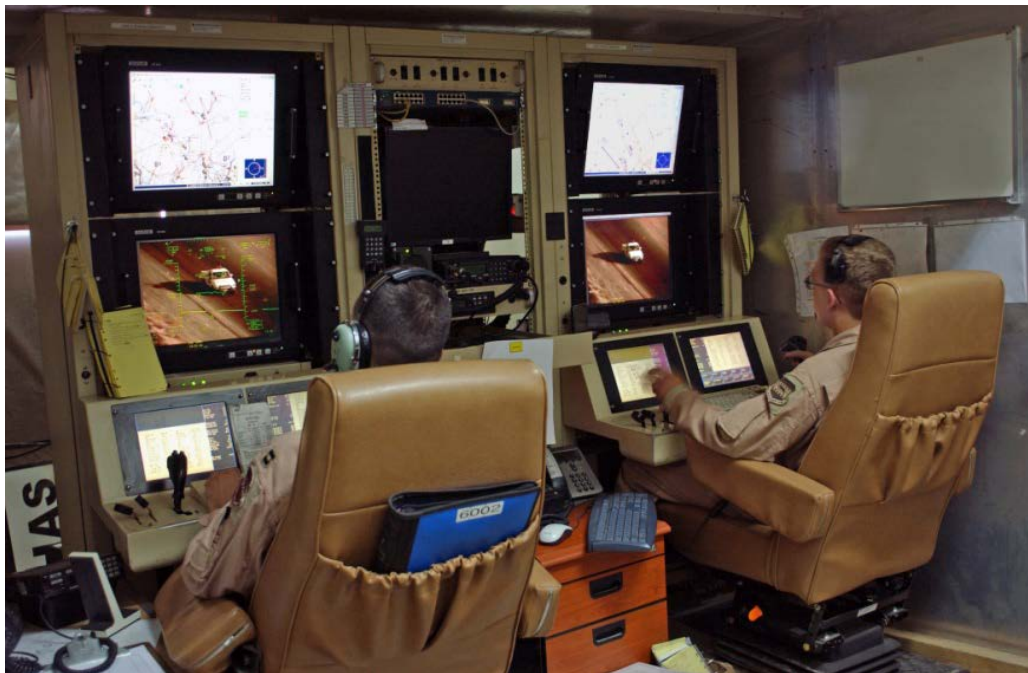
Figure 2. Inside View of Ground Control Station (Tab CC-3)

The basic crew for the Predator consists of a pilot to control the aircraft and command the mission and an enlisted aircrew member to operate sensors and weapons plus a mission coordinator, when required. The crew employs the aircraft from inside a GCS via a line-of-sight data link or a satellite data link for beyond line-of-sight operations. The MQ-1B carries the Multi-spectral Targeting System, or MTS-A, which integrates an infrared sensor, a color/monochrome daylight television (TV) camera, an image-intensified TV camera, a laser designator and a laser illuminator into a single package. The full motion video from each of the imaging sensors can be viewed as separate video streams or fused together. The aircraft can