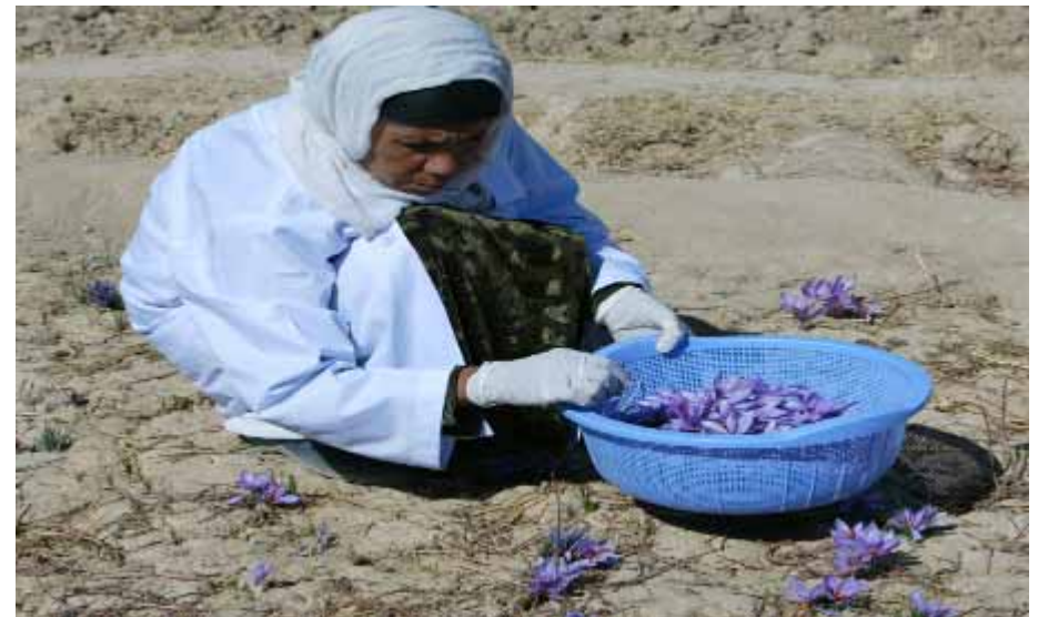
Saffron flower harvesting (Herat Province, Afghanistan)