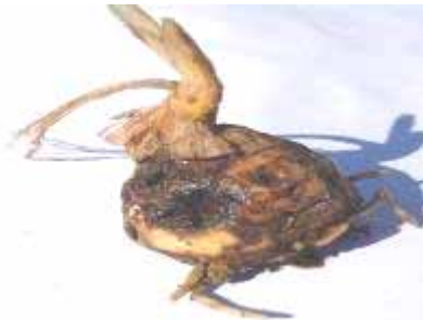
Unidentified fungus infection on saffron corms