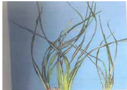
Tobacco rattle virus (TRV)