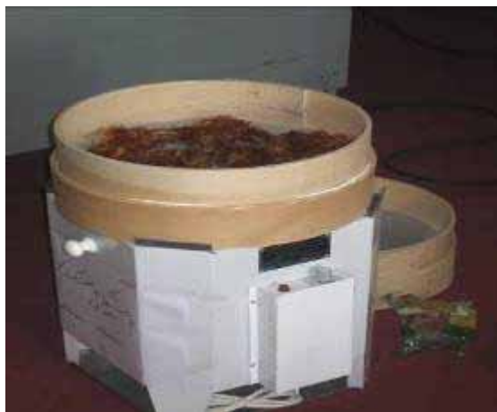
Saffron electric dryer introduced recently in Herat Province, Afghanistan