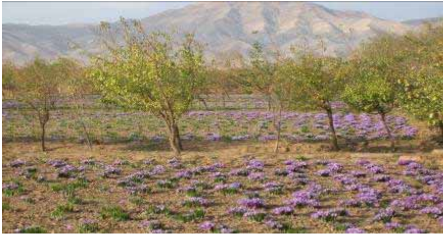
Traditional pit planting method (Herat Province, Afghanistan)