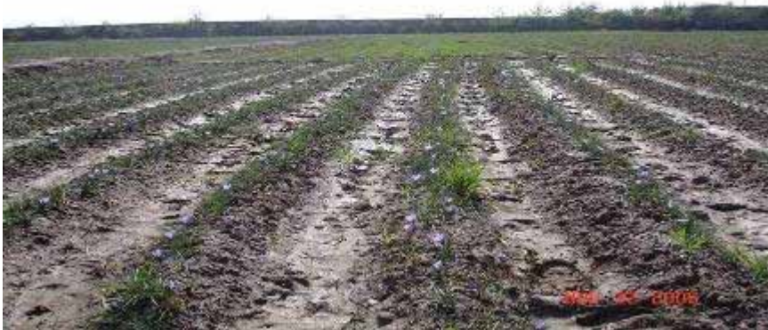
Ridge planting method (Herat Province, Afghanistan)