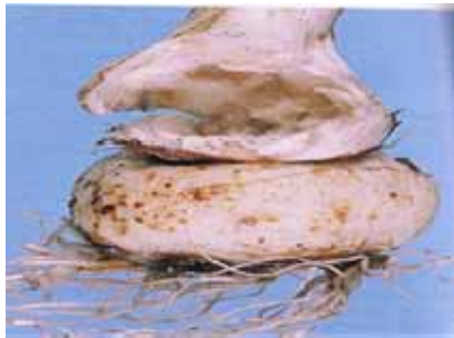
Bird damage to saffron corm