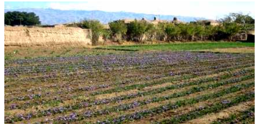
Flat bed planting method (Herat Province, Afghanistan)