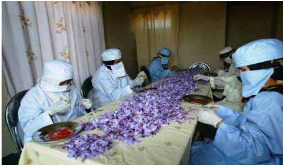
Separation of stigma from flowers (Herat Province, Afghanistan)