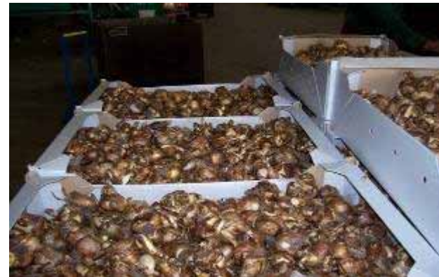
Corm packaging for transport to the field

Corm packaging and transport: Saffron corm packaging and transportation to new fields should be done very carefully. Plastic or carton boxes are suitable. A maximum load of 15 – 17 kg per box is optimal.