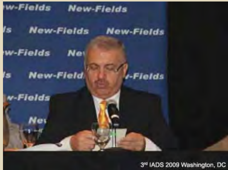
Major General Hussein Ali Kamal Ahmedfahmi Deputy Minister Ministry of Interior, Republic of Iraq

New-Fields Exhibitions, Inc. 1101 Pennsylvania Avenue, NW 6th Floor, Washington, DC (202) 202-536-5000 Fax (202) 280-1239