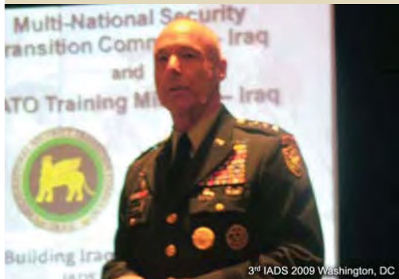
LTG Franck Helmick Commanding General Multi-National Security Transition Command-Iraq