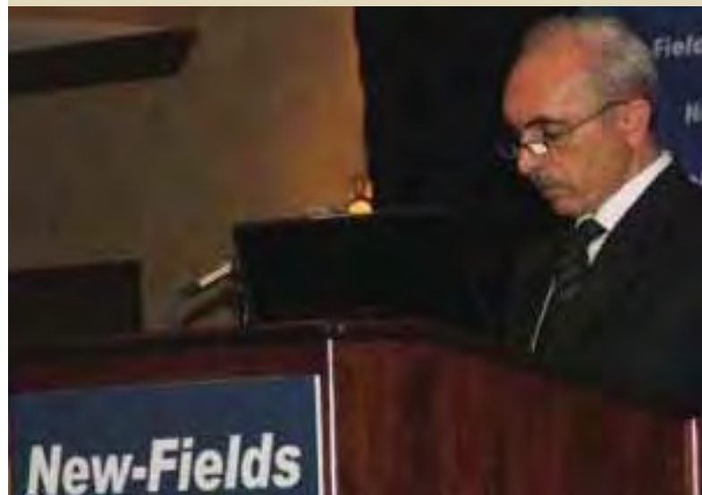
General Babakir Zibari Iraqi Armed Forces Commander & Chief of Staff Iraqi Joint Forces, Ministry of Defense, Republic of Iraq