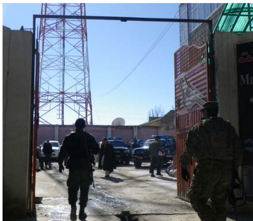
AUP escort and trucks behind the hotel. Most were gone when we left, possibly showing their responsibility to the governor and not necessarily the security of the event.