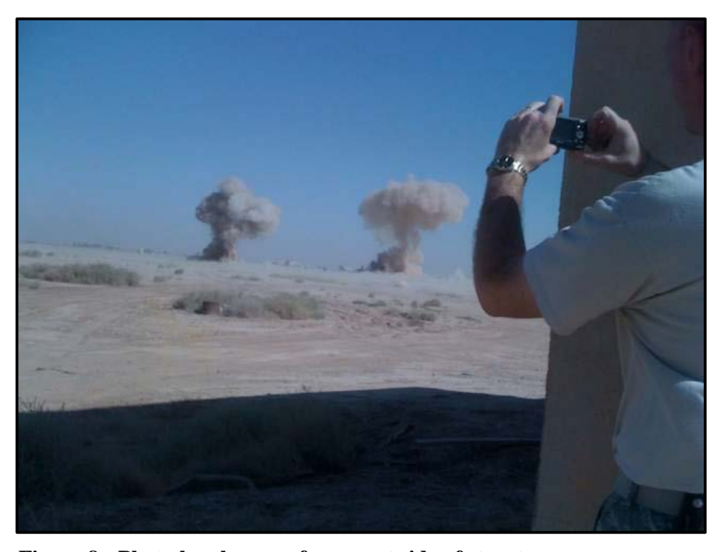
Figure 8: Photo by observer from west side of structure

AFMAN 91-201 (Explosive Safety Standards) paragraph 12.74.4., Technical Order (T.O.) 60A-1-1-4 (Protection of Personnel and Property), and the 332 ECES EOD FOI 32-3002 all require the maximum protection to personnel from the potential dangers from ammunition and explosives. (Tabs O-12, AA-15, AA-28, AA-34 – 35) On the day of the mishap, several personnel—both EOD technicians and casual observers—were in direct line-of-sight of the detonations. (Tabs V-1.12, V-2.20, V-3.7, V-12.4 – 5, V-13.12, V-14.8, Y-5, Y-6) The photograph below shows that several observers did not have either frontal or overhead protection during the detonations.