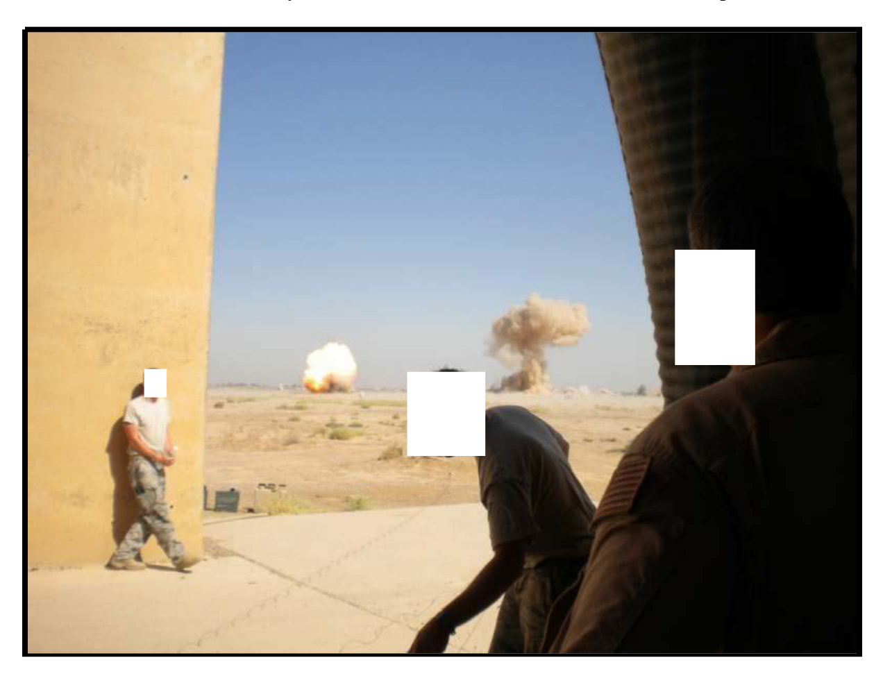
Figure 4: Observer photo immediately after second detonation (No casualties appear in this photograph)

incident. (Tab O-28) Within seconds, EOD Member #3 gave a "Fire Two" command, and the second observer initiated his system and detonated the second demolition set-up. (Tab V-16.19)