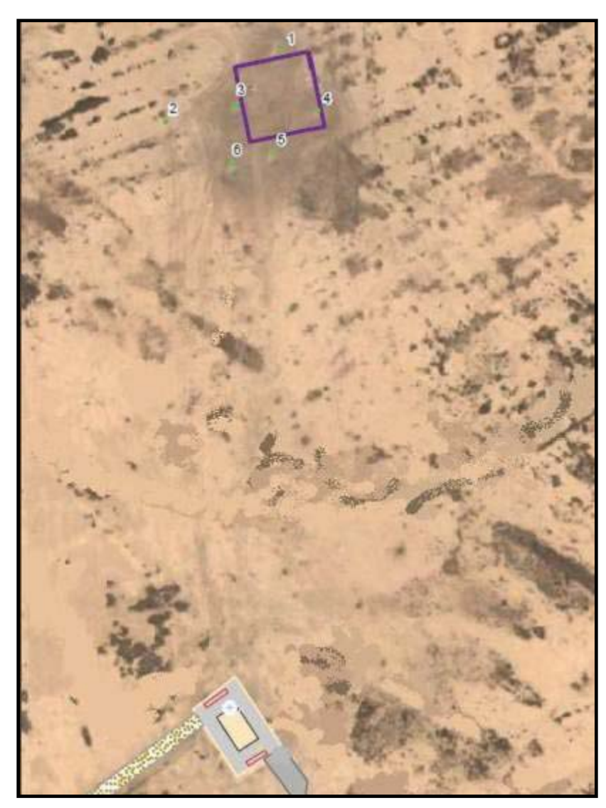
Figure 1: Diagram of EOD Range Structure and Detonation Area

Approximately three observers and one EOD member assembled at each of the six locations on the range and began carefully arranging ordnance and placing C-4 under direct supervision of EOD members. (Tabs O-13, V-13.5, V-26.2, V-47.2) At each of the six detonation sites, an EOD member explained basic principles of ordnance disposal and safety. (Tabs V-13.5, V-47.3) Four of the six detonation sites were located in shallow pits in the ground while two were on level ground. (Tabs Y-3, Y-4, Y-25 - 28)