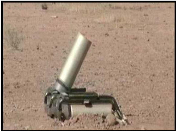
Figure 6: Photo of Detonation 1 Set-Up