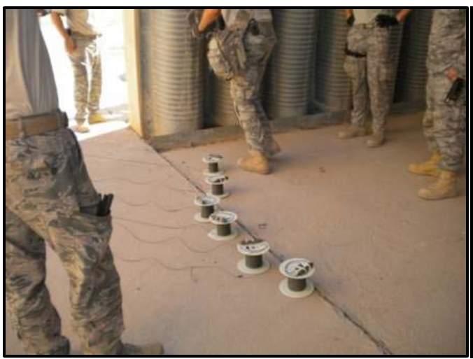
Figure 2: Placement of shock tube and initiators